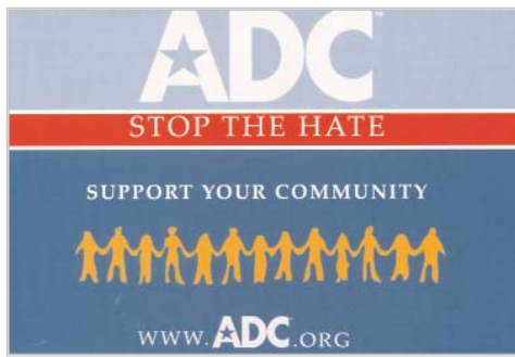
ADC's Support Your Community Postcard