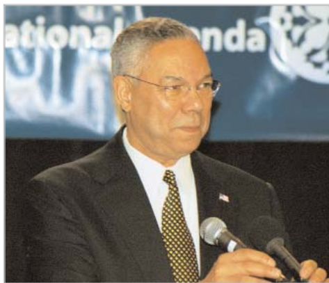
Secretary of State Colin Powell speaking at the 2003 ADC Convention