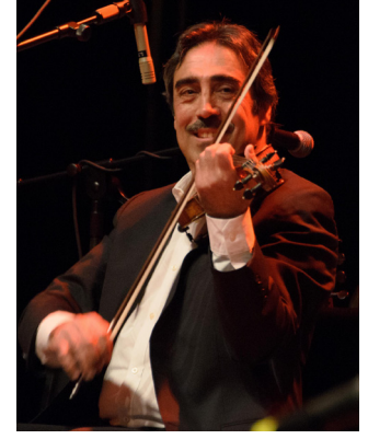
PRESERVING ARAB CULTURAL HERITAGE ADC preserves Arab American heritage by

Presenting the annual National Arab-American Festival and Turaath, highlighting the beauty of Arab culture and the diversity of our community. These events help to dispel stereotypes while allowing Arab Americans to learn about their heritage.