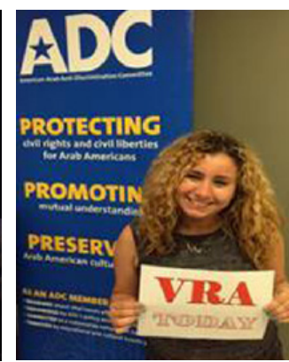
PROTECTING CIVIL RIGHTS The ADC protects Arab American civil liberties by

Assisting victims of discrimination through the pro bono ADC Legal Department, working directly with clients to resolve their legal matters and providing support to high impact civil rights cases.